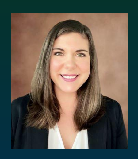
1201 West Peachtree Street NW #2500 Atlanta, GA 30309

Tel: (773) 350-5654 julia.johnson@kornferry.com