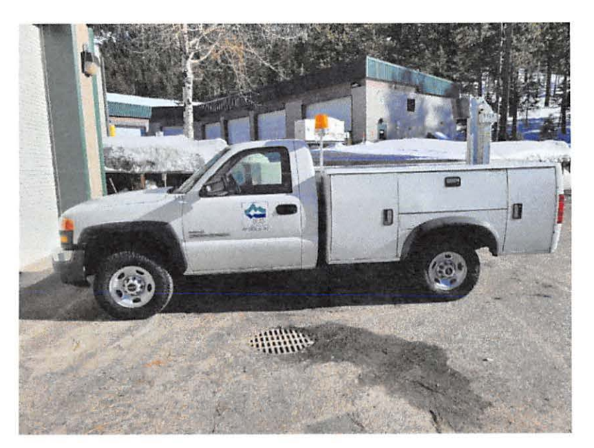
Truck # 543