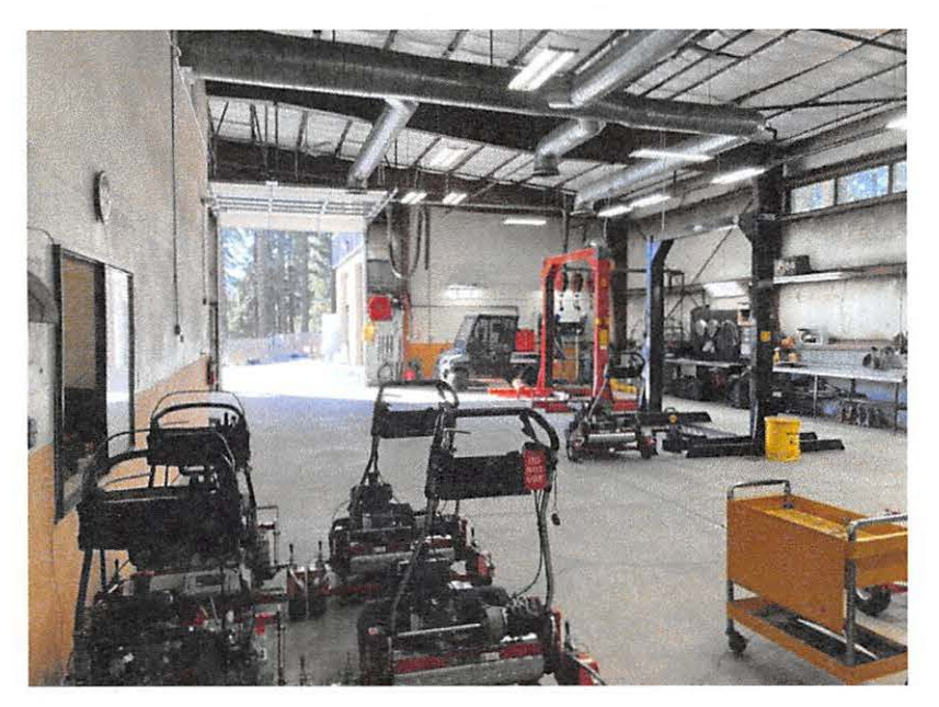
Championship Golf Shop