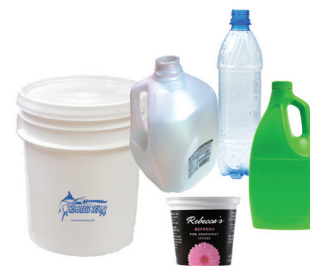
Empty Plastic Bottles & Containers