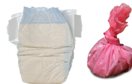
Diapers & Pet Waste