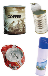
Empty Aluminum, Tin & Steel Cans