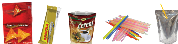
Food Wrappers, Straws, & Juice Pouches