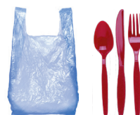
Plastic Bags & Utensils