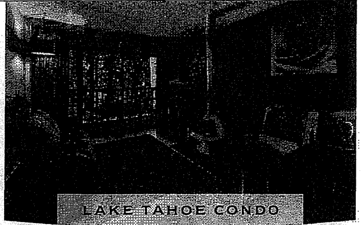
LAKE TAHOE CONDO

2435 VENICE DRIVE, SOUTH LAKE TAHOE, CA, 96150 • 530-541-5683 OPEN ONLY FRIDAY AND SATURDAY THIS WEEK, UNTIL THANKSGIVING.