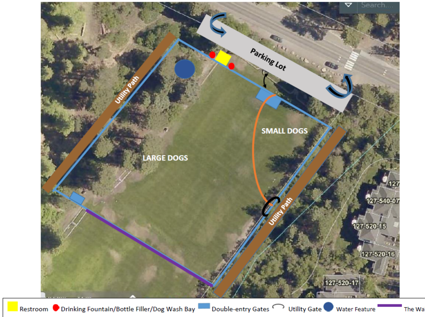
Exhibit A - Proposed Village Green Dog Park